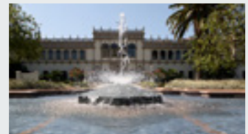
English Language Academy, University of San Diego

Studying abroad can be one of the most exciting experiences of your life! The English Language Academy (ELA) offers a total immersion experience, where you can improve your English and also enjoy San Diego – a beautiful city in Southern California.